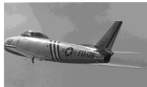
NORTH AMERICAN F-86F SABRE JET