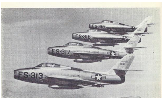
REPUBLIC F-84F THUNDERSTREAK

In Sept. 1956, we decided to return to civilian life to raise our family and after a few years as an Inactive Reserve Officer we decided to resign my commission and become an Air Force Veteran for the rest of my life.